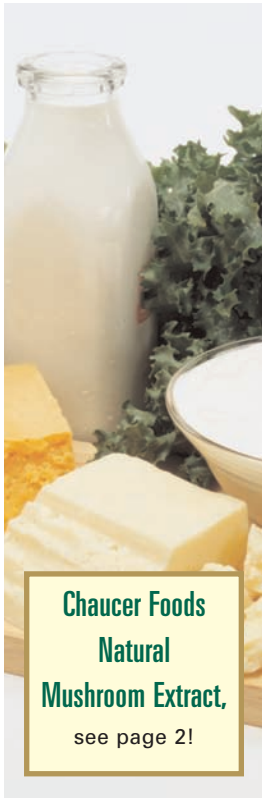
Chaucer Foods Natural Mushroom Extract. see page 2!

Published by Accurate Ingredients, Inc. © 2007 All Rights Reserved.